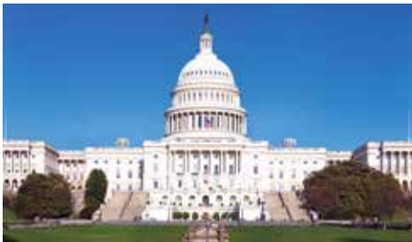
United States Capitol, Washington

Since 1874, we've provided air quality solutions for some of the most complex structures in the world. And for over 40 years, York is the chosen brand by Canadian consumers when it comes to ensuring year-round comfort for their loved ones. And because York units are designed and built in North America, you can be confident that your system will provide your family with comfort, energy savings and lasting performance.