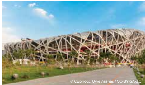
National Stadium, Beijing