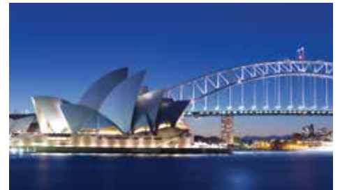
Opera House, Sydney